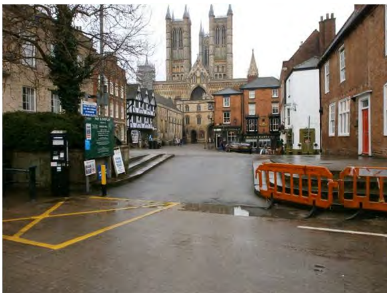
Above: The Castle Hill Car park is the closest to the cathedral.