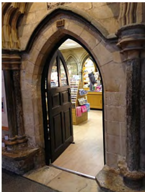
Left: The entrance into the shop.