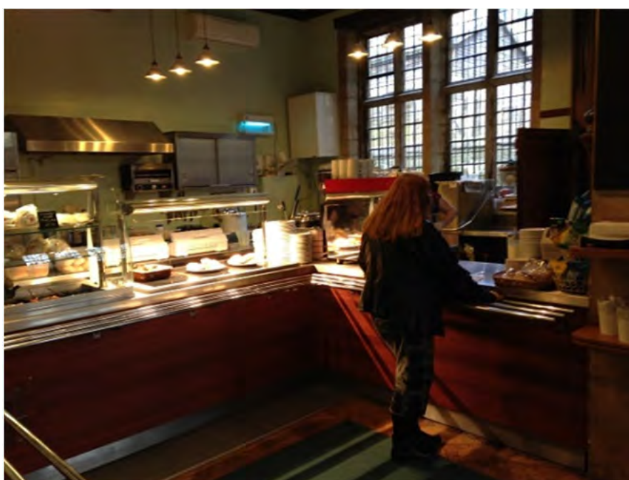
Above: The service counter in the café.