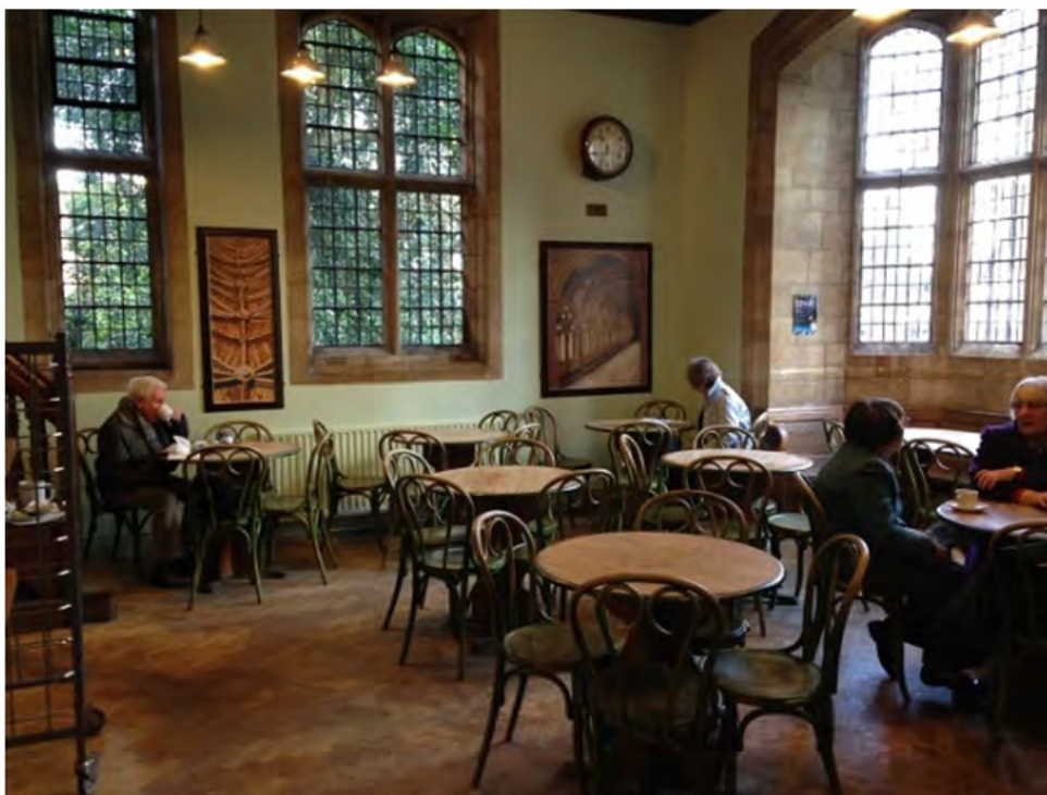
Above: The seating area in the Refectory Café.