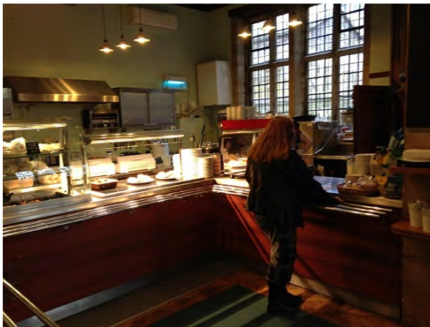
Above: The service counter in the café.