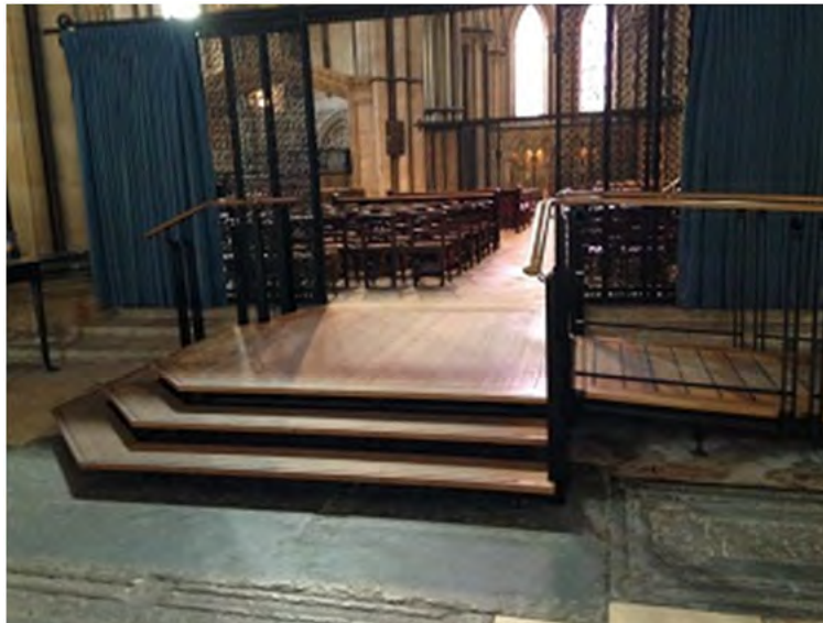
Above: The steps into St Hugh's Choir.