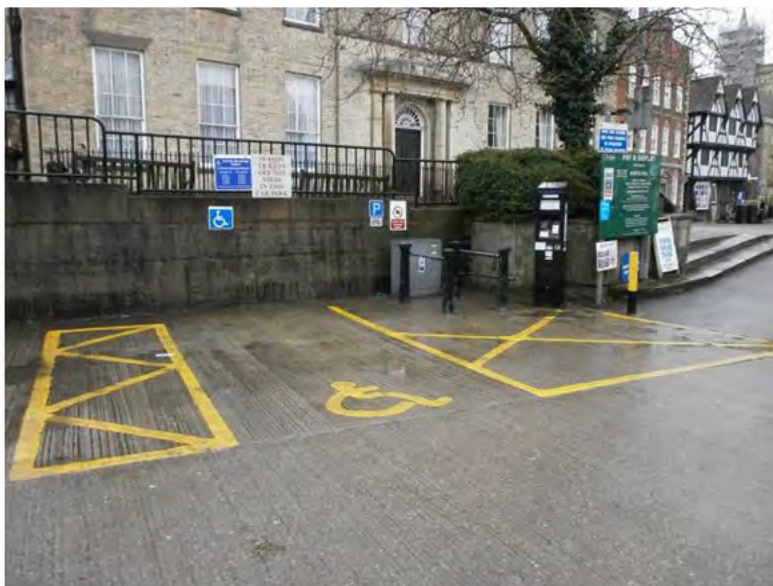
Above: The accessible parking bay.