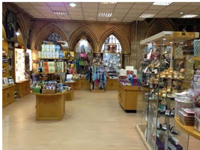
Below: the floor space in the shop.