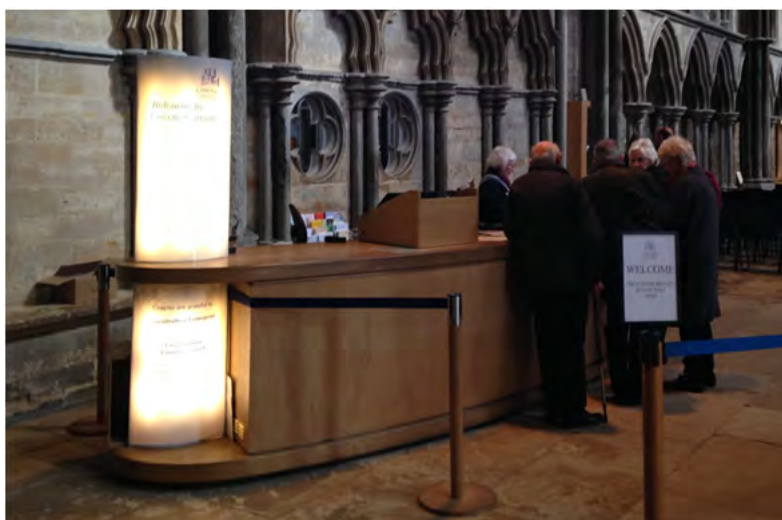
Above: The ticketing and reception area inside the cathedral.