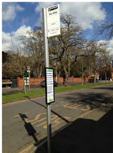
Left: Bus stop by the Lincoln Hotel (stop for the cathedral). Right: Bus stop on Nettleham Road (stop for the Bus Station)