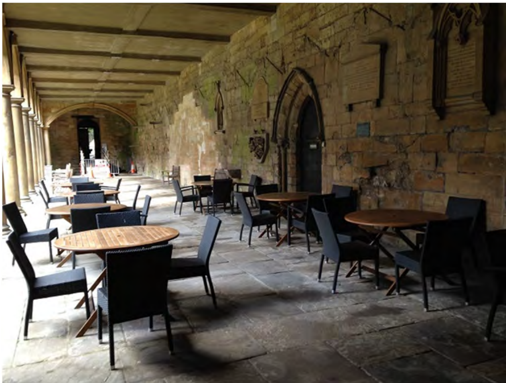
Above: Café seating in the cloister.