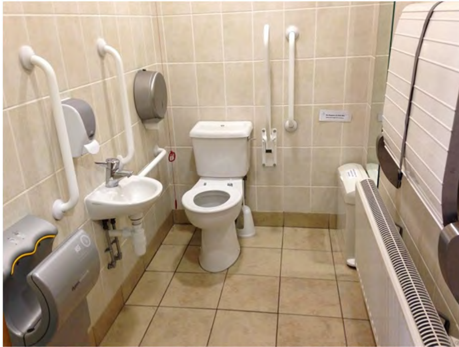
Above and below: the accessible toilets located off the cloister.