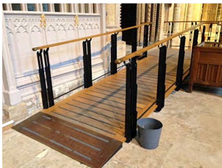
Above: The steps and ramps between levels inside the nave.