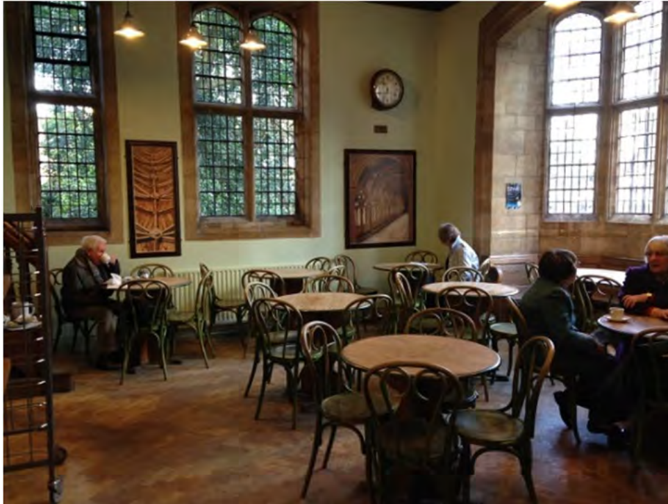
Above: The seating area in the Refectory Café.