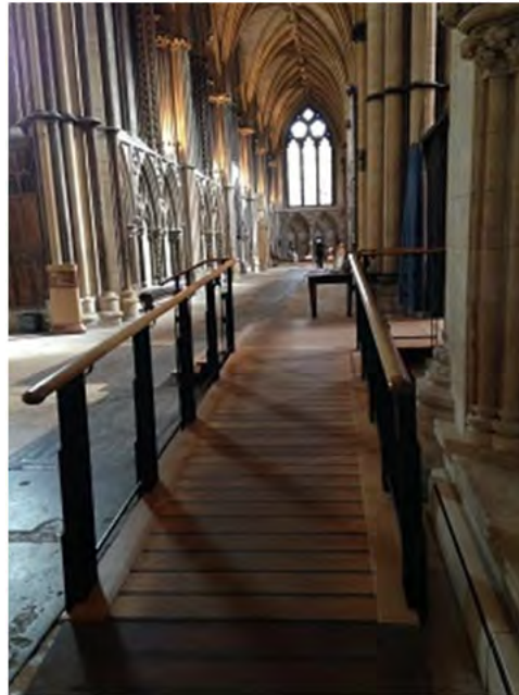
Above: The ramp into St Hugh's Choir.